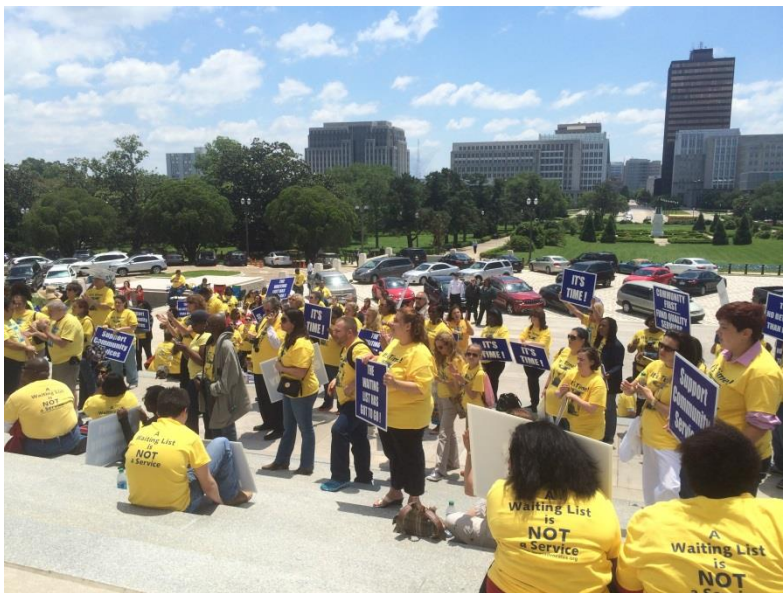
LaCAN advocates gather on the State Capitol steps during the 2015 Disability Rights Day.