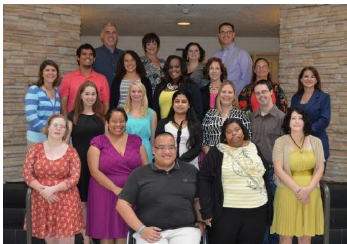
2015 Louisiana Partners in Policymaking Graduates

The Council provided information and technical assistance to self-advocates and their families.